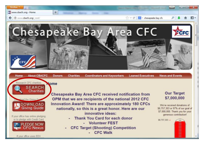
Atlantic Coast – Search box on homepage

Chesapeake Bay – Prominent homepage search link